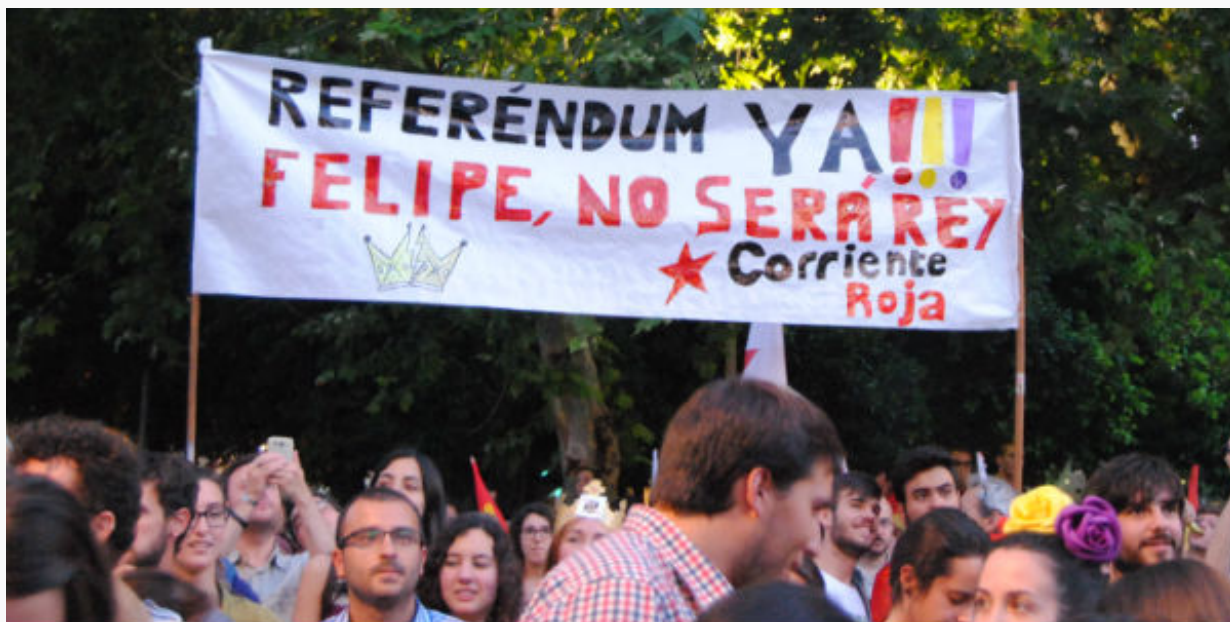
'Referendum – Yes! Felipe will not be King.' A demonstration in Seville in 2014 calls for a referendum on the monarchy.