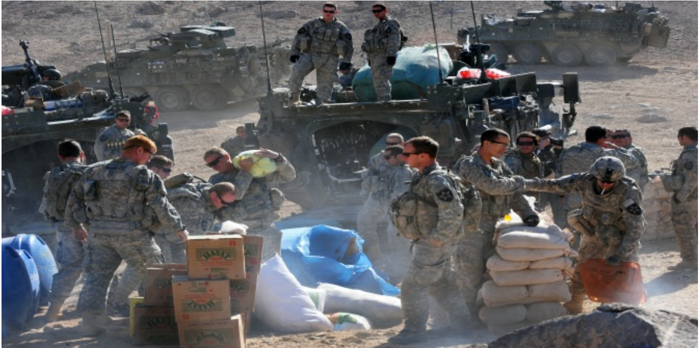
US Soldiers with Charlie Company, 1st Battalion, 17th Regiment unload Humanitarian aid for distribution to the town of Rajan Kala, Afghanistan, 2009