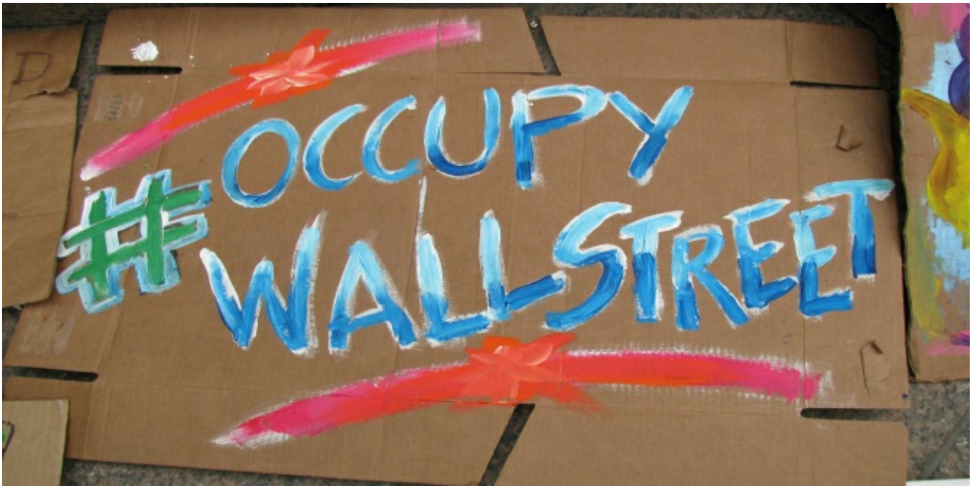
Occupy Wall Street Sign, Liberty Plaza, NYC, 2011

Otherwise, Populism's Power is structured largely chronologically: after a lengthy theoretical chapter, the book moves onto detailing the Populist revolt of US agrarians in the nineteenth century, the role of cultural markers of populist imagery in advertising and modern populist movements from the Right and the Left, and concludes with looking at smaller social movements that are attempting to cross boundaries of inclusivity in how they operate.