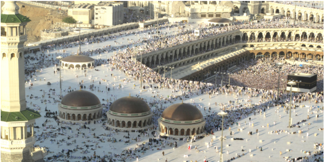
Masjid al-Ḥarām, Mecca, Saudi Arabia, 2009

Across six chapters, Al-Rasheed first discusses the situation prior to and during the 2011 Arab uprisings, stating that unlike in other Arab states, activists in Saudi Arabia could only resort to using strong petitions due to severe restrictions on public protests. These formal petitions carried democratic impulses, calling for more inclusive methods of governance and better relations between rulers and the governed. However, the author notes that during the same period there were also activists advocating for even stricter Islamic law, thus creating a conflict of interests. The author goes on to highlight the immense role that the Saudi Association of Civil and Political Rights (HASM) played during the uprisings. The association mobilised Saudis and organised several online campaigns to advocate for human rights and the release of prisoners of conscience.