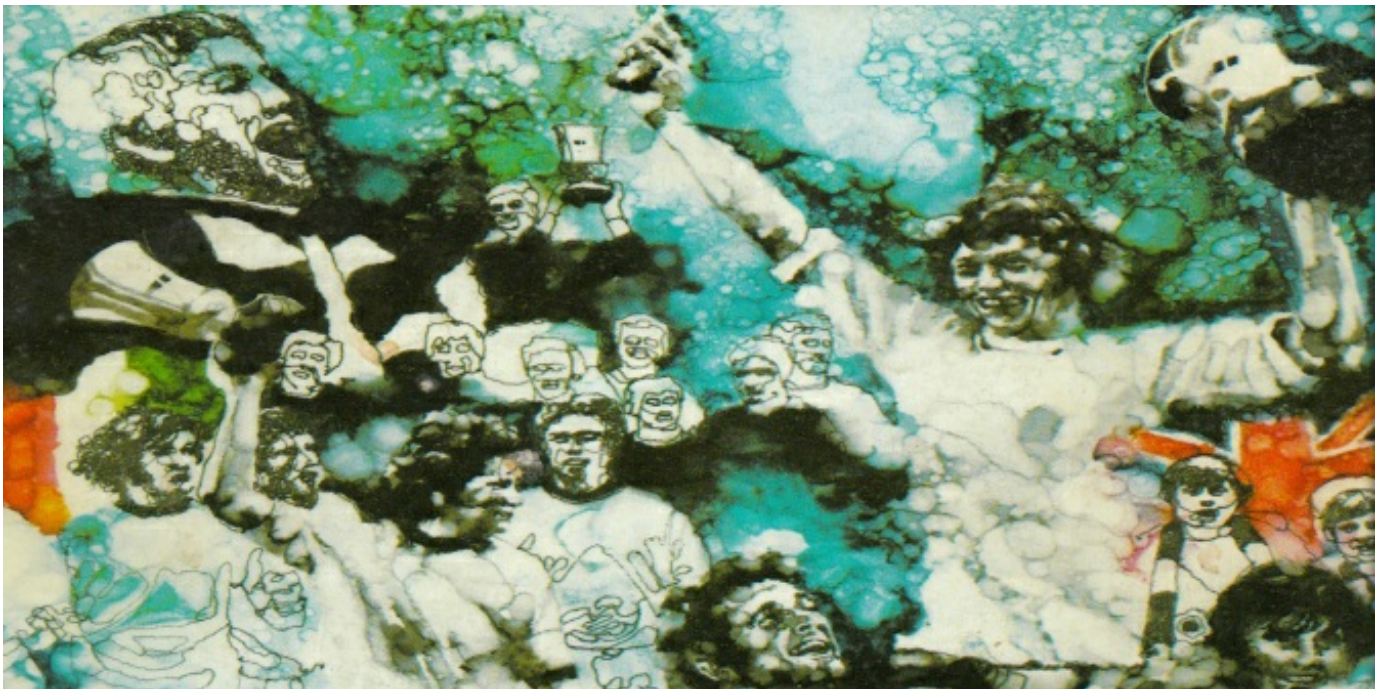
Image Credit: Anglo-Italian Cup 1973 – Official Souvenir Handbook. Newcastle Utd beat Fiorentina 2-1 in the final ( footysphere CC 2.0 )

However, blaming foreigners is not a new spectacle in English football. Domeneghetti observes how the Roy of the Rovers comic strip – a long-running popular comic following the topsy-turvy world of fictional footballing demi-god, Roy Race – expressed negative stereotypes held by British fans when Roy ventured into European adventures. Opposition teams were often 'sneaky', 'unfit' and more defensively inclined, unlike the cavalier Roy Race. Visits to South America were even more dangerous, with Roy's entire team being kidnapped twice whilst on different tours in the 1960s.