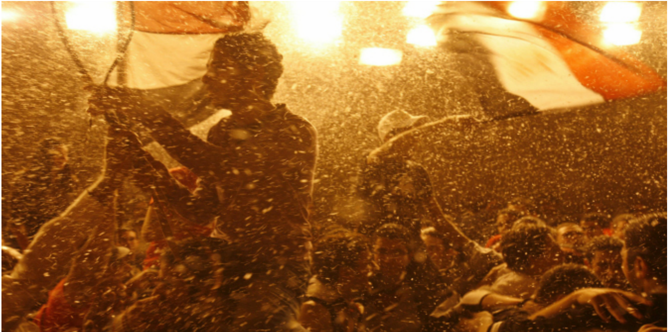
Egypt v Algeria, 2-0, 2010 World Cup qualifier

Although the stadium can act as a place of suppression – as evidenced by the mass graves discovered in Iraqi stadiums by US troops following the toppling of Saddam Hussein in 2003 – it can incubate revolutionary ideals, as shown not only in Iran, but also in countries including Libya, Turkey and Egypt. Stadiums are also barometers for gauging levels of frustration in a population and a training ground to build battle-hardened protesters for confronting government might. In the Tahrir Square revolution of 2011 in Egypt, footballing Ultras stood between the mainstream protesters and police fury. From regular training altercations on Saturdays when supporting their teams, they were prepared for the onslaught of tear gas, had honed ‘hit-and-run tactics’ and had mastered strategies of rotation and withdrawal to avoid panic and fatigue.