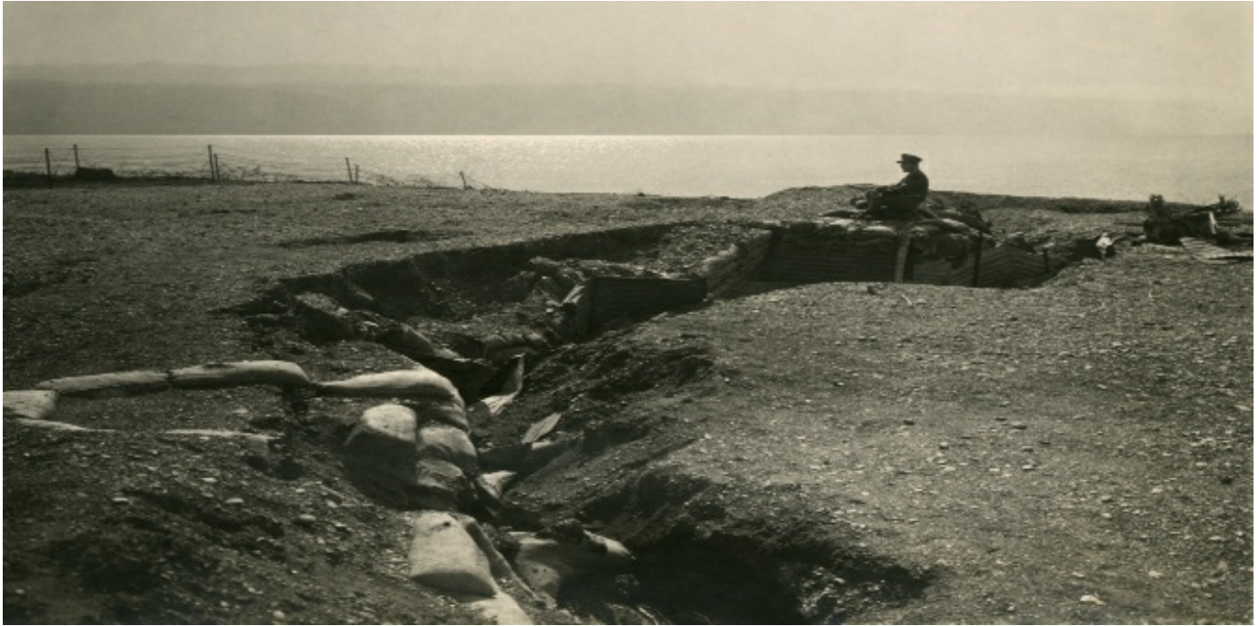
Trenches on the shores of the Dead Sea, 1918

recount the Middle East campaign, and the narrative of the book tends to lose its professed focus on analysing the wider conflict in favour of lengthy chapters on Lawrence and his personal experiences of the war. Of course, Lawrence's trajectory through the conflict can give us insights into the conduct of British operations, but one does often wonder what new information this route can present us and whether there are shades of Orientalism in choosing Lawrence as the main character.