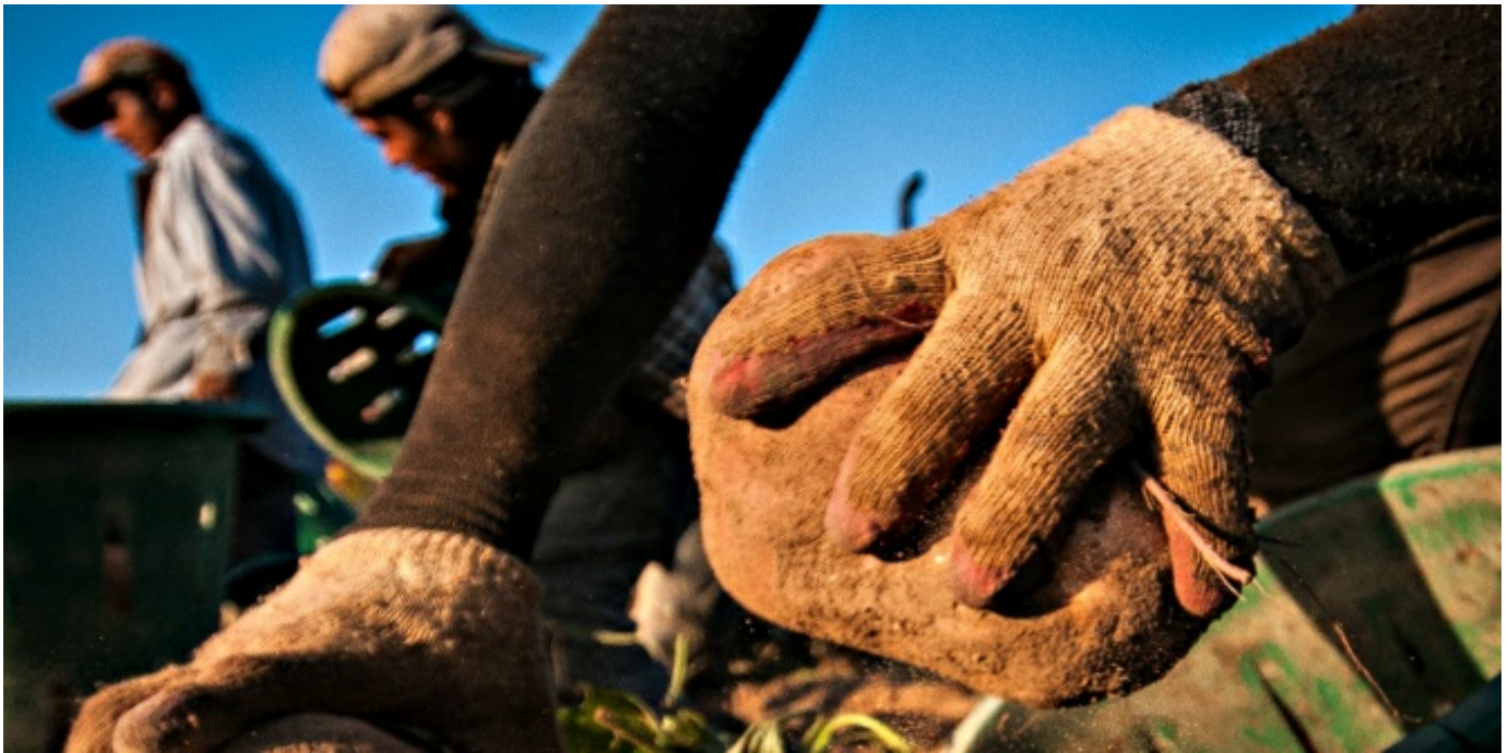
Image Credit: Migrant workers in Mechanicsville, VA, United State of America, 20 September 2013 (US Department of Agriculture, Lance Cheung, CC 2.0).

The practical lessons this offers tend to some of the missing links in the migration policy fads du jour . Marek Čaněk's contribution on migrant forestry workers in the Czech Republic, for instance, brings home how redundant the migration and development breakthroughs hailed by the development elite become if migrants cannot claim their labour rights – after all, what good are remittances if wages are stolen? – while demonstrating how professional NGOs, sensitive to risking delicate relationships with government, are not always in the best position to agitate for change.