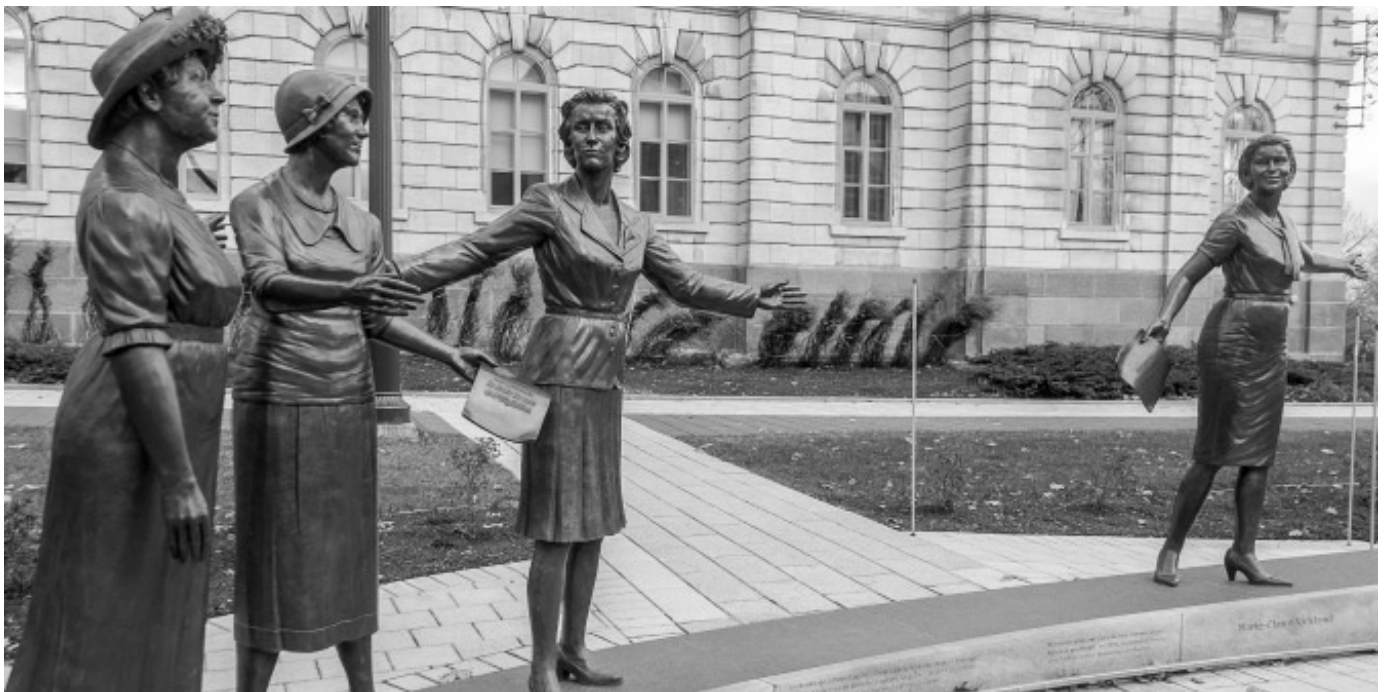
Image credit: Paul VanDerWerf Womens’ Voting Rights Pioneers CC BY

Our effort to set questions of gender inequality within the context of overlapping areas of social, political, professional and economic life constitutes one form of what social scientists have called intersectionality : in other words, the insight that social outcomes such as gendered inequalities are produced by multiple intersecting forces such as ethnicity, wealth and educational and social status, migration status, sexuality, age, care responsibilities, marital status. We point for example to the differential impact of recent social, welfare and labour market policies on poor women, on women with caring responsibilities, on single mothers, and on women from certain ethnic minority groups; to the lower worth of legal protections against violence to those with insecure migration status; to the differential impact of implicit biases in the media on older women and women from particular social groups.