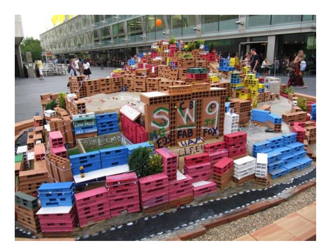
Figure 3: Close-up of portion of Project Morrinho installation at Southbank Centre in London. This section was built by youths from Stockwell and Brixton and features elements of London's poorer immigrant districts whose presence is generally unseen in the cultural center of the English capital.

Festival Brazil transmitted mixed messages about politics of space and the representation of urban identity. In one sense, it communicates a sense that a slum somewhere is equivalent to a slum anywhere, that spaces of certain forms of poverty and violence may differ but share common characteristics that form the basis for translocal cultural exchange. In the awkward yet productive exchanges between Morrinho and Stockwell youth, I could discern an attempt to foster Black Atlantic encounters out of a soft kind of environmental determinism that insisted on the "slum" as a unmarked (yet marking) category. In another register, simultanously, the exhibition places the favela alongside samba, Gilberto Gil, and capoeira without specifying how they interrelate under the rubric of Brazilian cultural heritage, except as an affective repertoire. Another sign cites neo-noir detective novelist Patrícia Melo: "Brazil is astonishment, chaos and progress." The sign added further weight to the widely held assumption that the spectacle of