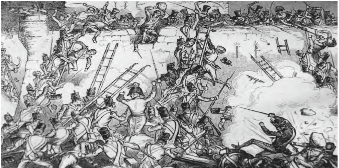
Battle of Badajoz during the Peninsular War

Clausewitz viewing such battles as wholly tactical, serving to observe the enemy and obstruct its advance. So although it might be tempting to skim through – this first text makes up two-thirds of the book – these notes are imperative in showing the origins of his thinking on small-unit warfare, and in contextualising the texts that follow.