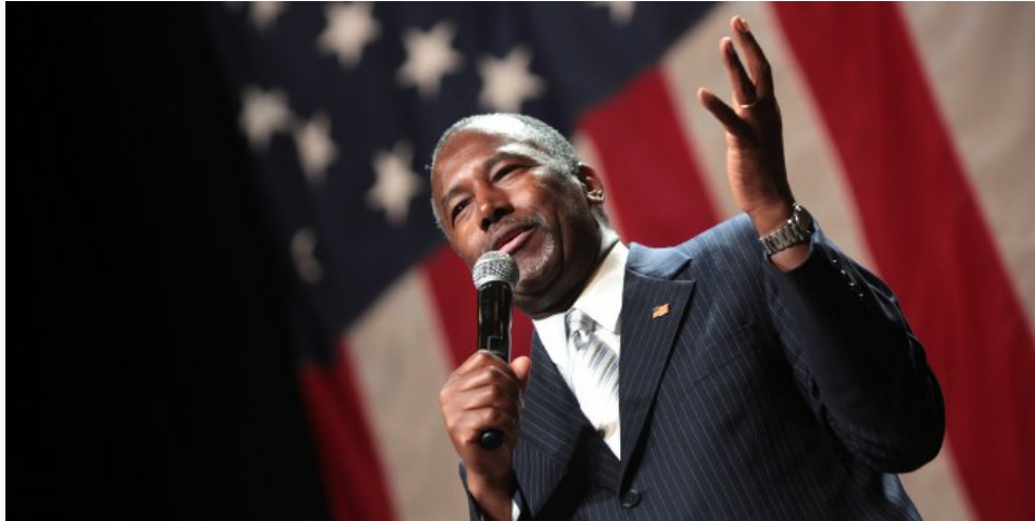
Dr. Ben Carson