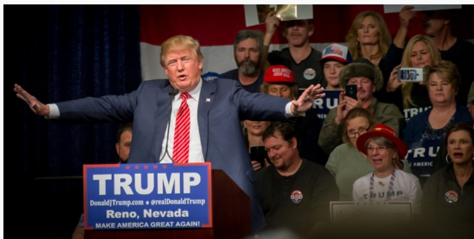
Donald Trump