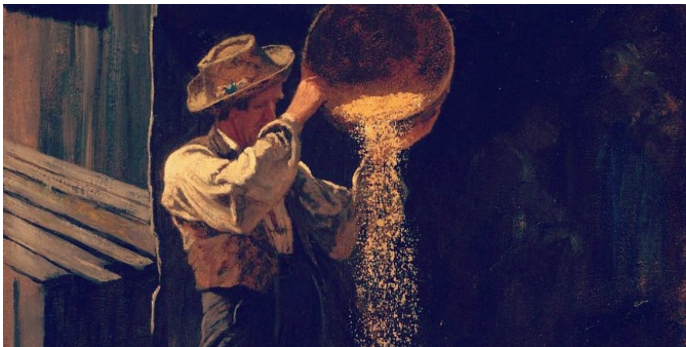
Image credit: Winnowing Grain Eastman Johnson Museum of Fine Arts, Boston

Yet we don't want to be. Many scientists choose their career because they are curious and want to find real answers to meaningful questions. In its idealized form, science is a process of proposing explanations and then using data to expose their weaknesses and improve them. This process is both elegant and brutal. It is elegant when we find a new way to explain the world, a way that no one has thought of before. It is brutal in a way that is familiar to any graduate student who has proposed an experiment to a committee or to any researcher who has submitted a paper for peer-review. Logical errors, alternative explanations, and falsification are not just common – they are baked into the process.