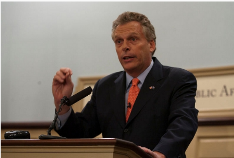
Terry McAuliffe By Miller Center [CC-BY-2.0 ( http://creativecommons.org/licenses/by/2.0 )], via Wikimedia Commons

Delaware Liberal writes Tuesday that we may have witnessed the de facto repeal of the death penalty in the state. They say that the state's Supreme Court has placed a hold on all death penalty cases in Delaware in response to the US Supreme Court's recent ruling that a Florida statute which granted judges the exclusive right to determine death sentences was unconstitutional. Delaware has exactly the same law, and it's something that only the state's General Assembly can change.