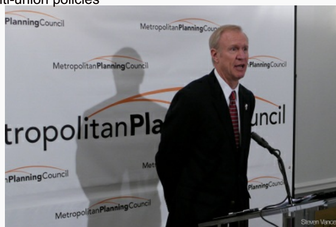
Illinois Governor, Bruce Rauner