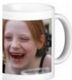
India Laughing Anthony Kelly € 15,95 Flickr - CC BY 2.0