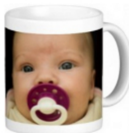
Baby Emily Kitt Walker € 20,95