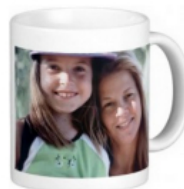
Mother Daughter Dave Parker € 15,95