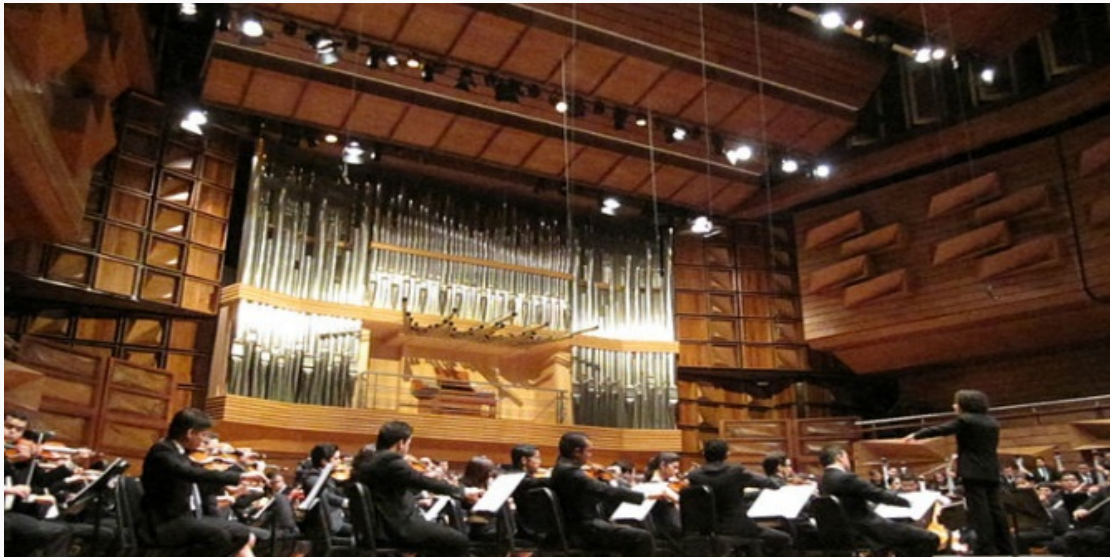
El Sistema and Gustavo Dudamel in concert in Center for Social Action Through Music, Caracas, Venezuela.

people in El Sistema are also internalising values of obedience, hierarchy and competitiveness. This occurs through a system where the standard pedagogic experience involves being shouted at (or even hit) by a young, untrained, poorly paid teacher (there are fifteen index entries in the book for 'verbal abuse and humiliation'). An orchestra may symbolise social interaction without enacting it; democracy is not harmonious, but 'diverse and discordant'. Despite this, the 'web of metaphors' around the ideal of the orchestra is so powerful that we fail to ask critical questions because we are intoxicated by Mahler.