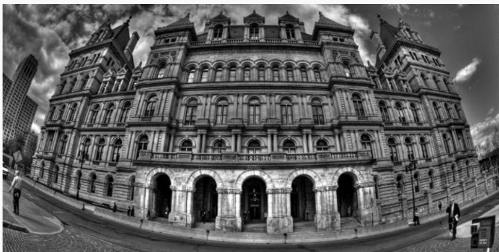
New York State Capitol

Heading south, NH Labor News says that the Granite State’s budget battle is raging as state Republicans pushed through a budget which has a $90 million hole due to tax giveaways to large out-of-state corporations at the expense of education, healthcare and transport. Efforts by Democrats in the state Senate to amend the budget continuing resolution that would have authorized 96 percent spending were defeated by Senate Republicans.