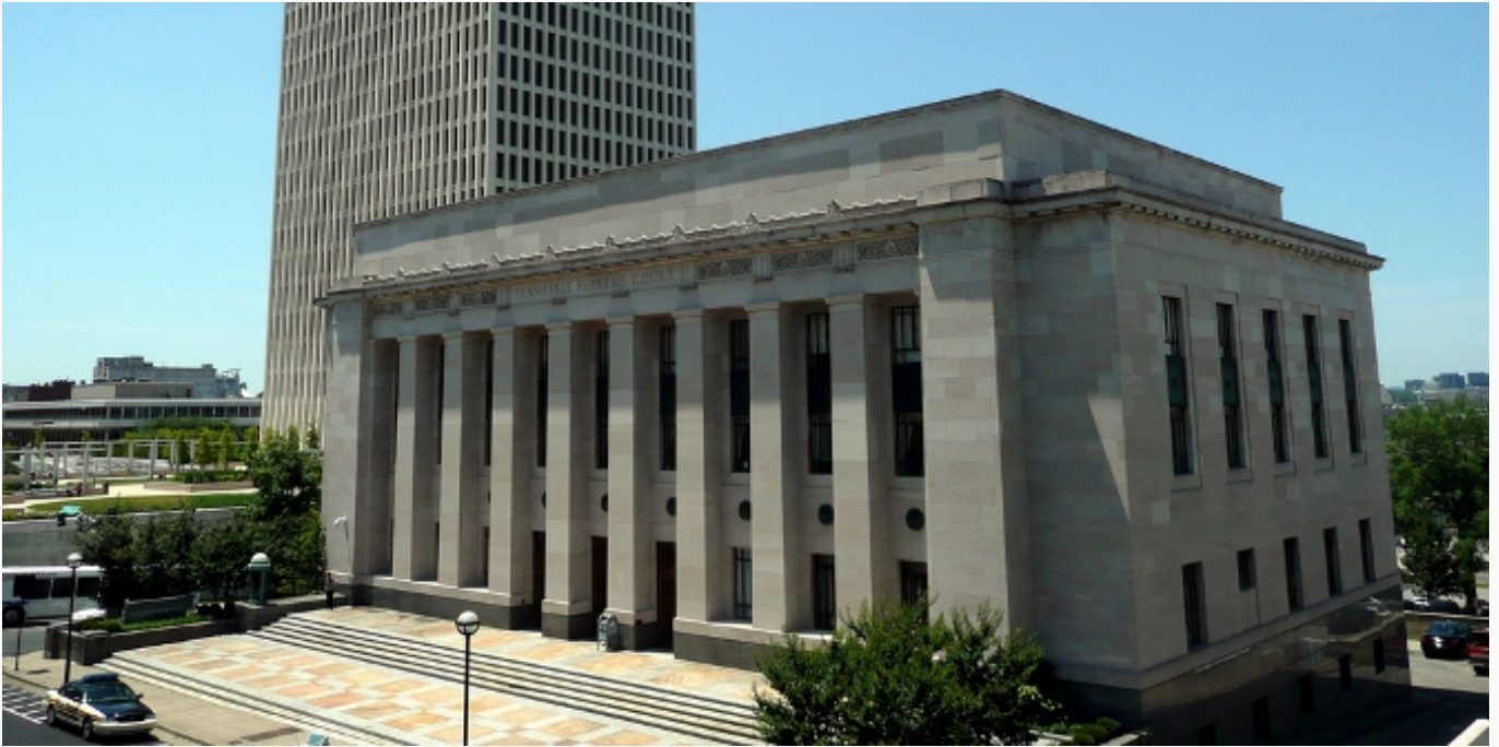
Tennessee Supreme Court

In the biggest constitutional change of the night in terms of the judiciary, Tennessee has eliminated the so-called merit system in favor of a modified federal system. 61 percent of voters in Tennessee voted to allow the governor to appoint judges of the Supreme Court and intermediate appellate court, subject to confirmation by both houses of the legislature. Judges would still have to run in retention elections to keep their seats. So, the big change here is taking power away from the unelected Judicial Nominating Commission (under the old system, this group presented a list of names to the governor, and the governor was constrained to choose from this list; there was no legislative involvement) and vesting it in the elected governor and state legislature. By keeping retention elections, the people remain involved in retaining judges. Interestingly, the amendment also states that a nominee is considered confirmed if the legislature fails to reject him or her within 60 days. This will ensure judges are able to take their positions quickly and will prevent institutional gridlock leading to the understaffing of the bench.