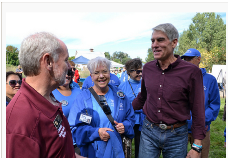
Colorado Senator Mark Udall