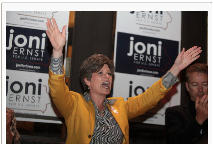
Iowa State Senator Joni Ernst

Heading north to Minnesota, True North wonders on Wednesday if increased polling of the state's GOP candidates for Senate and Governor is a sign of a Republican wave of unexpected victories. They say that it is striking that neither incumbent Governor Mark Dayton or Senator Al Franken have been able to reach 50 percent support, just days before the election.