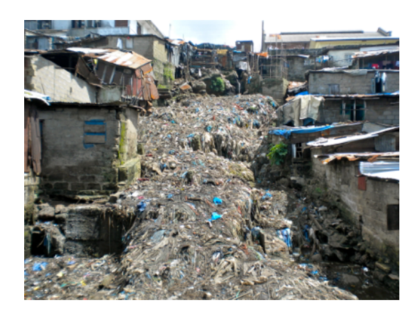
Housing in Susan Bay, Freetown