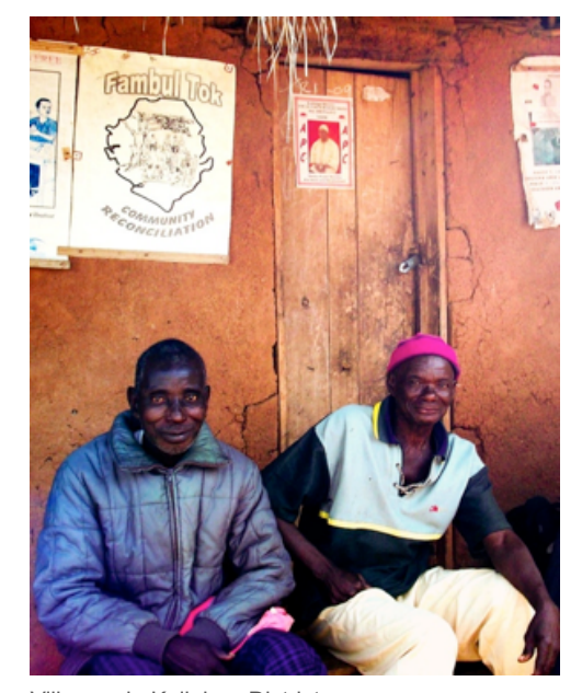
Villagers in Kailahun District