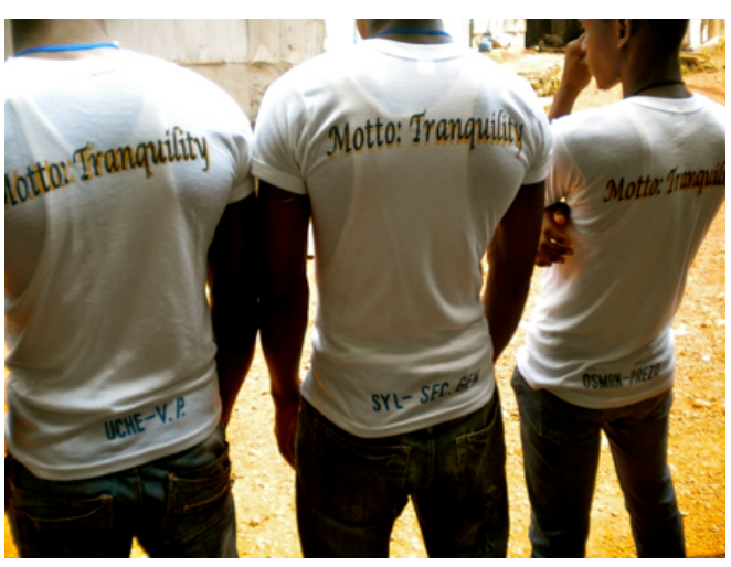
ICON Brothers – Youth Club in Freetown.