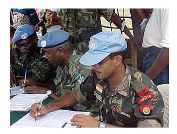
UN Peacekeepers registering ex-combatants at Seabwema.

are used to serve the purposes of the reintegration of perpetrators, and are coerced into 'reconciling'. Victims are too frequently expected (often by the very external TJ actors who promote victim-centred justice) to forgive a wide variety of perpetrators so that the community can move forward.