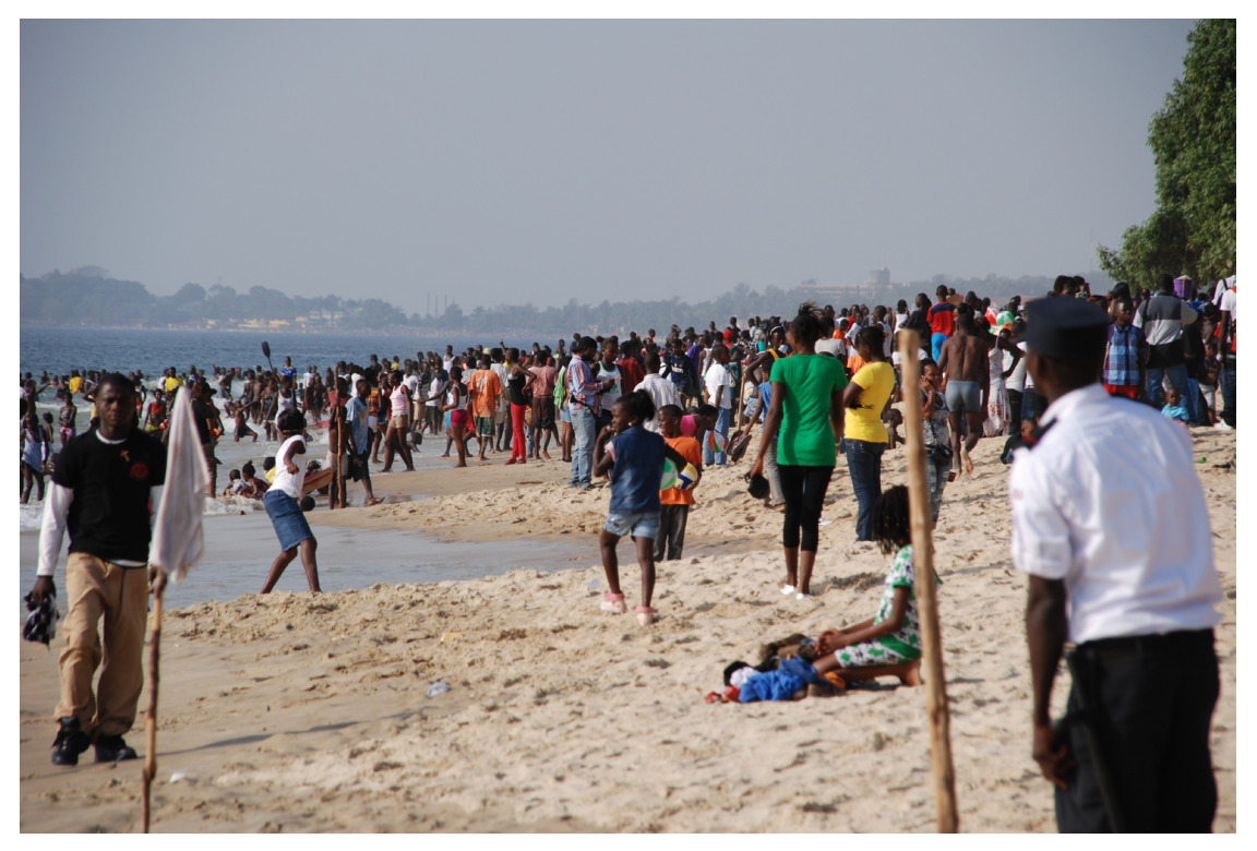
Sierra Leone's striking natural beauty is a side of the country that remains largely unseen by the international community. Lumley Beach