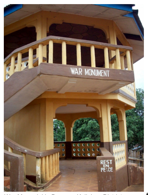
War Memorial in Bomaru, Kailahun District

Legacies of violence persist long after ceasefires are signed and international monitors leave. The social scars of war remain after its physical remnants fade. For many outside observers, the first association with Sierra Leone, a small country of just under 6 million people, is blood diamonds and amputations. Since the end of the war, the country has again come to international attention for its multiple efforts to address the war and move beyond a violent past. While transitional justice has become an increasingly globalised and prescriptive field, how a country comes to terms with violence and moves forward is far from clear. The December 11th, 2012 conference on Transitional Justice marked the ten-year anniversary of the civil war's conclusion, democratic elections, and the culmination of the high profile Charles Taylor trial in the Hague. The conference presented a unique opportunity to take stock of the impact of transitional justice, raising several key themes.