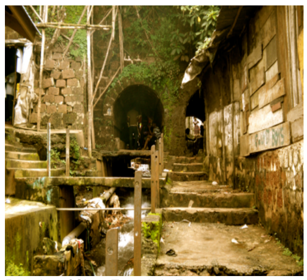
Remains of Slave Tunnels in Freetown Belgium District

accurately, poor) in international connections. This was a colony founded on the international trade of people – between 1668 and 1807, more than 50,000 slaves were shipped to the Americas by British slave Traders via Bunce Island near Freetown, and Freetown itself was founded as a home for freed slaves and London's 'black poor' in 1787. Sierra Leone was a British colony up until 1961 and the TRC noted, in determining the causes of the civil war, the effects of British rule in establishing a two-tier system that privileged those who lived in prosperous Freetown versus those who lived in the rest of the country.