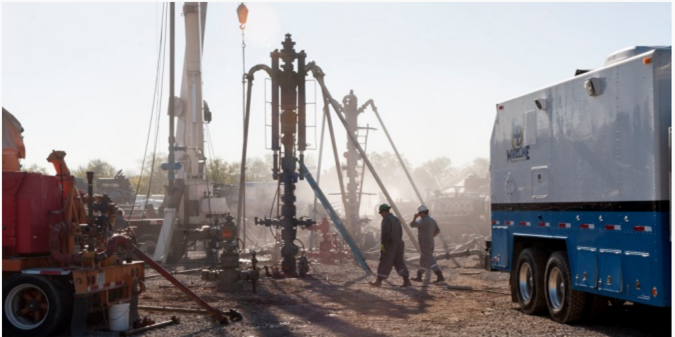
Fracking in the US

As well as a lack of information about UK gas reserves there are technical reasons why it and the US differ. The US already has been producing onshore natural gas for a long time (something the UK has never done) which has led to it being able to move quickly from conventional production to unconventional production. It is not clear how long it will take the UK to build a similar service sector, but the lack of one will at the very least lead to production costs being higher here (Bloomberg New Energy Finance estimate that production costs will be 2-3 times higher in the UK than in the US). As well as this, the Boland shale which is most likely to be exploited in the UK is in a dense population area of Northern England. In the US almost all shale gas has come from areas with low population density; more populous areas such as New York and New Jersey have thus far blocked shale gas production. There are many reasons to suspect energy companies will find it more difficult to produce gas in areas with high population.