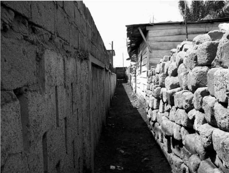
Figure 4. Passageway showing concrete, stone, and timber walls.