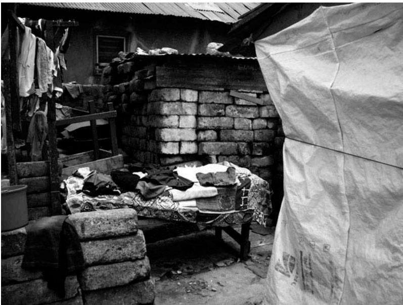
Figure 2. Dwelling with multiple materials, including plastic, brick, and iron cladding.