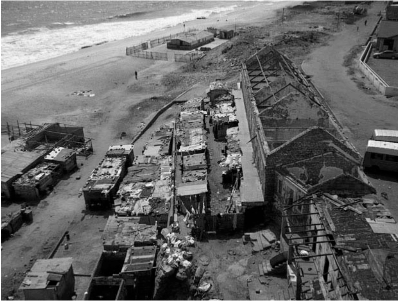
Figure 1. Improvised housing on the beach in Ga Mashie.