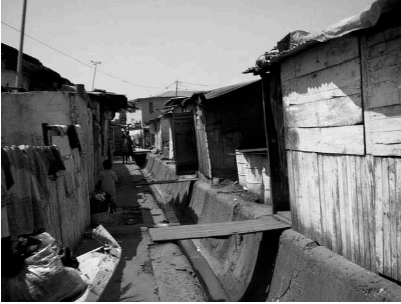
Figure 3. Timber-constructed walkway over sewerage.