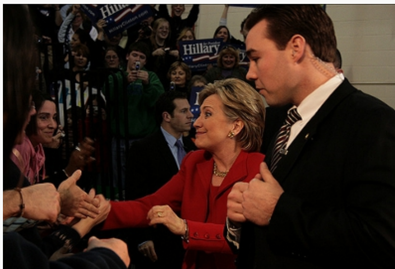
Hilary Clinton on the campaign trail in 2008

Last week, the memoirs of former Secretary of Defense, Robert Gates, caused a stir in Washington DC, with its criticism of President Obama's military policies. While some have said that Gates was wrong to criticise a sitting President, The Atlantic disagrees , writing that Gates owes no loyalty to Obama, as the revealing of these sorts of criticisms are in the public's interest. Meanwhile, The American Prospect says that both of Obama's terms have lacked any real scandals of 'serious malfeasance', much to the chagrin of Republicans. Despite lacking real scandals since 2008, Obama's approval rating has dropped to around 42 percent. Sabato's Crystal Ball looks at whether or not the President has an approval 'floor' of around 40 percent or so.