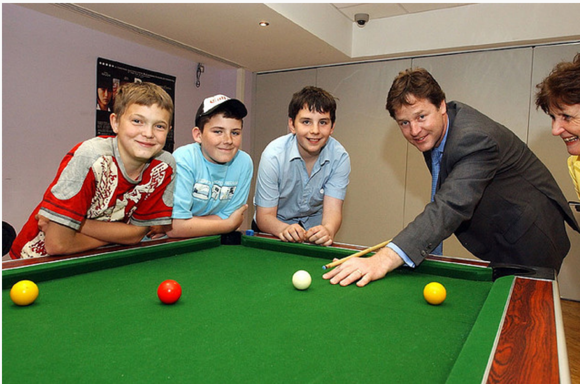
Deputy Prime Minister Nick Clegg engaging with young people.