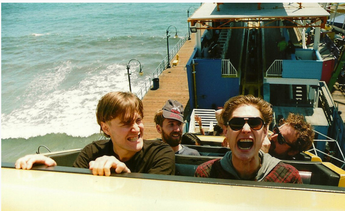
The rollercoaster-shaped relationship between age and electoral turnout.

It is established that young people tend to vote less than older generations, particularly in Britain. However, less well understood are the differences in turnout among young people. Based on elections in Finland and Denmark, Yosef Bhatti , Kasper M Hansen , and Hanna Wass have shown that turnout is highest when young people can vote immediately after being enfranchised, and then falls away. This phenomenon, they argue, supports some of the arguments in favour of lowering the voting age to 16. This post is part of our ongoing series on youth participation .