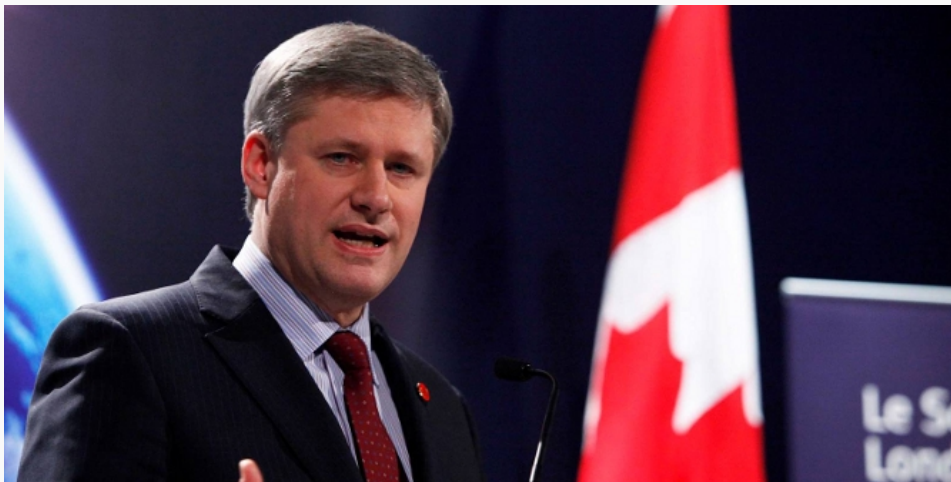
Stephen Harper, Conservative Prime Minister of Canada, is leading the reforms.

Two events in our most recent federal election (2011) shook Canadians' trust in their electoral processes. A first incident featured robocalls (automated telephone calls) made to hundreds of Canadian households, falsely informing voters that the location of polling stations had moved by Elections Canada. A second incident concerned a more standard type of electoral rule violation: Canadian political parties are subject to campaign spending limits, and the Conservative Party was found guilty of exceeding allowable spending caps for electoral advertising.