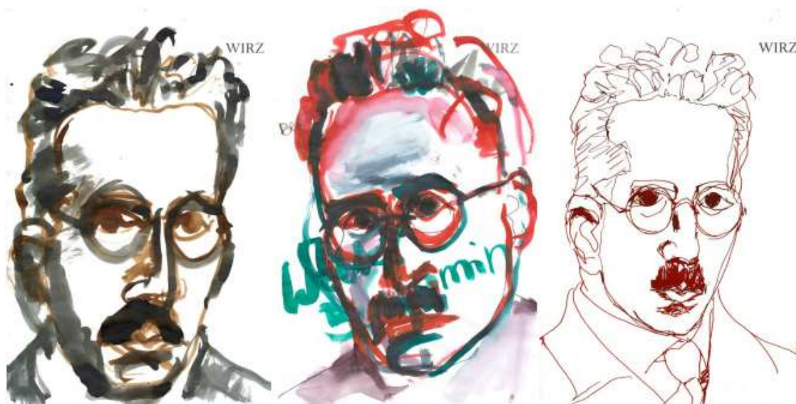
Sketches of Walter Benjamin.

Munich and Bern, before eventually gaining a position at Frankfurt. As a philosopher, during these early years he veered between Kant and Nietzsche, but as he matured as a thinker he moved more and more towards Marx, influenced in particular by Georg Lukács's History and Class Consciousness – perhaps the most important work in early Western Marxism – as well as by his interactions with the communist politician Karl Korsch and the playwright Bertold Brecht.