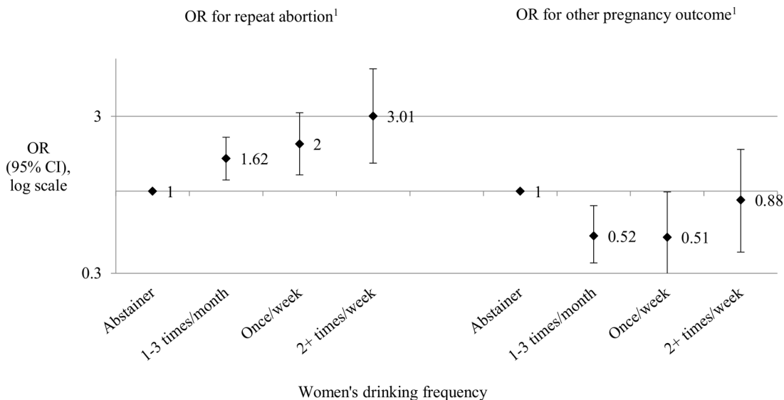
Figure 2. Adjusted odds ratios for repeat abortion and other type of pregnancy outcome related to drinking in the RLMS waves 5–12. 1 Adjusted for age, calendar time, marital status, parity, desire for more children, contraceptive use, education, employment status, household income, concern about affording essentials, life satisfaction and smoking. doi:10.1371/journal.pone.0090356.g002

An alternative explanation for the association between alcohol and repeat abortion could be that the experience of having a first abortion leads to an increase in alcohol use. A systematic review has found weak evidence for such an effect [33]. Moreover, the likelihood of abortion leading to increased alcohol use and psychological problems may be lower in Russia, given that abortion is relatively socially acceptable. Nevertheless, we explored this possibility in the RLMS using a subsample of women with continuous follow-up data from waves 6–11 (1995–2003), who had had no previous abortions at wave 6 (N = 337). We estimated how these women’s drinking at wave 6 (1995) predicted the chance of them having had at least two abortions (i.e. becoming repeat abortion clients) by wave 11 (2003). The results showed the same pattern of effect for repeat abortion as seen in Table 2: a dose-