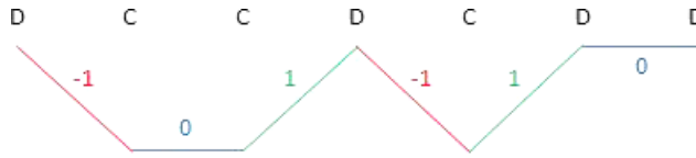
FIGURE 3. Changes in excess defections are reported on any given link for a particular action profile chosen by the players on a path.