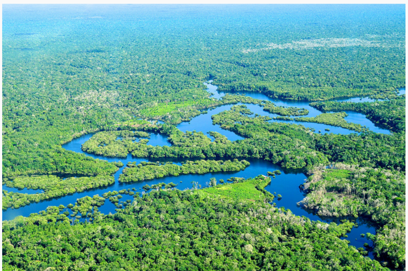
Aerial view of the Amazon Rainforest, near Manaus.

battle for rubber, and land, also held tragic consequences for the indigenous population. For example, Da Cunha describes, with almost painfully understated pathos, a meeting between the head of the Mashco Indians and the infamous rubber baron Fitzcarraldo. Trying to intimidate the native head, Fitzcarraldo showed him weapons and equipment and boasted about the various tribes Fitzcarraldo had “subdued”: “The sole response of the Mashco was to inquire what arrows Fitzcarraldo carried. Smiling the explorer passed him a bullet... The native...tried to wound himself with it, dragging the bullet across his chest. Then he took one of his own arrows and, breaking it, thrust it into his own arm. Smiling and indifferent to the pain he proudly contemplated the flowing blood that covered the point. Without another word he turned his back on the surprised adventurer, returning to his village with the illusion of a superiority that in a short time, would be entirely discounted” (p435).