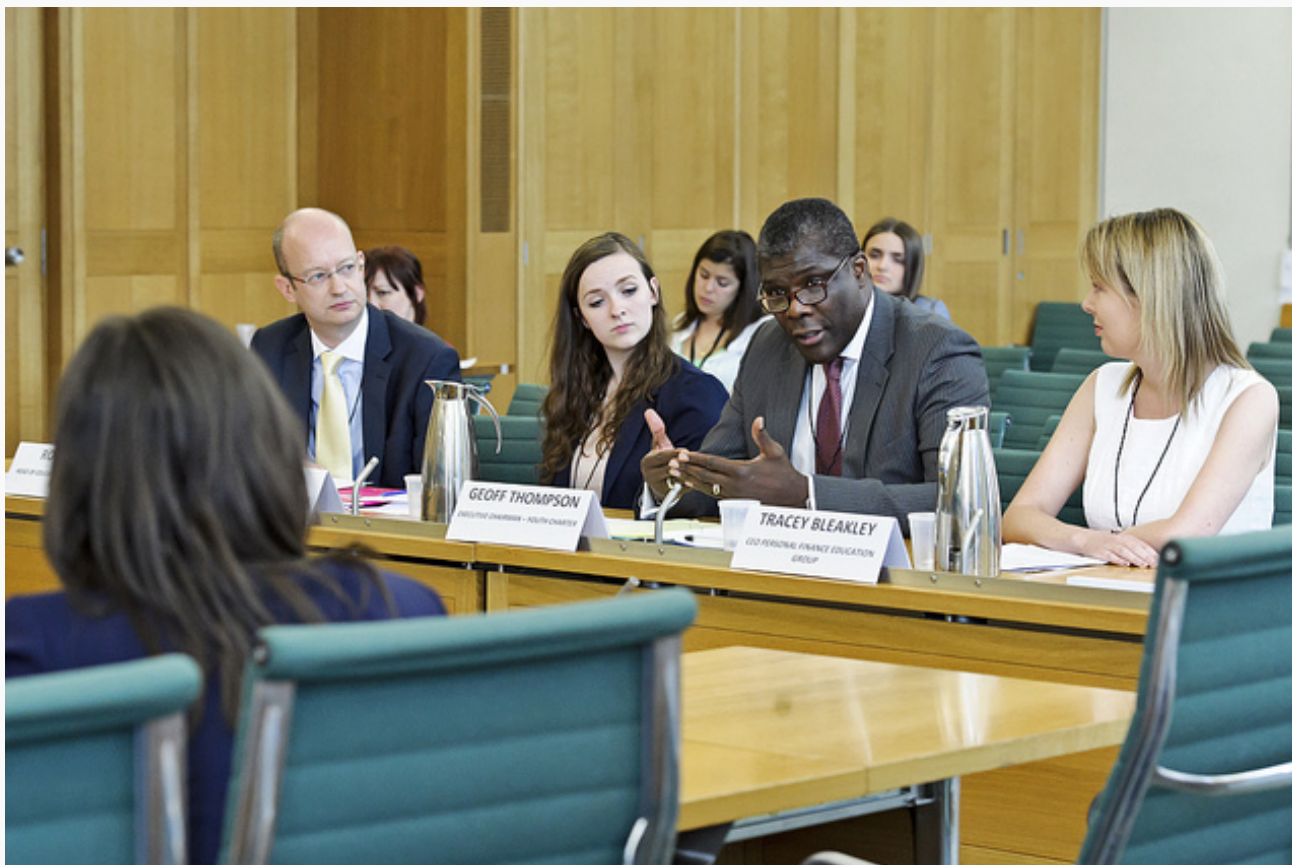
Can parliamentary committees help address democratic decline?

Committees are well established and important in each of the parliaments examined, as the authors acknowledge, 'but