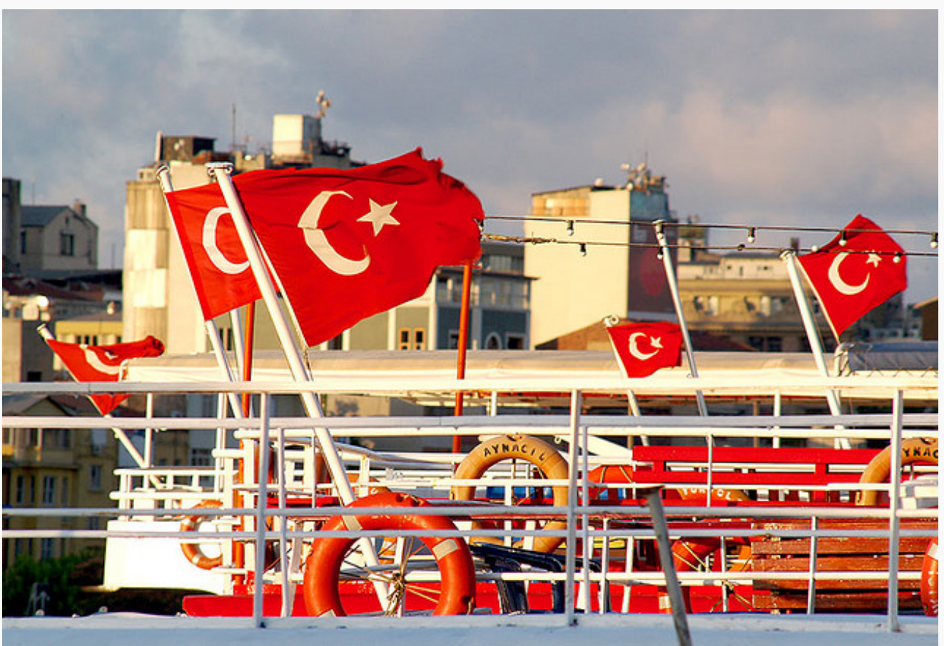
The European Union recently opened a new round of talks with Turkey on the country's 26-year-old application to become a member.

One of the many insights of the book is the argument that Europe needs to re-industrialise. While the service economy has dominated, there are new opportunities for digital technology, which is transforming both manufacturing