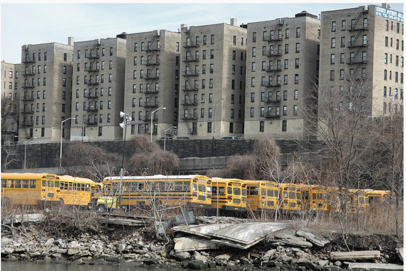
School buses in the Bronx.