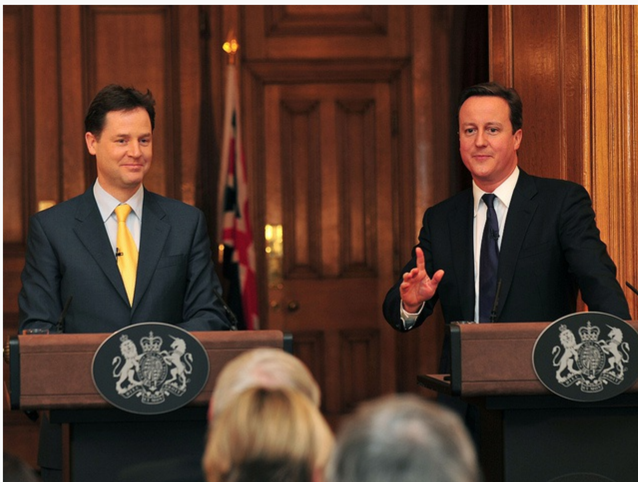
Prime Minister David Cameron and Deputy Prime Minister Nick Clegg.