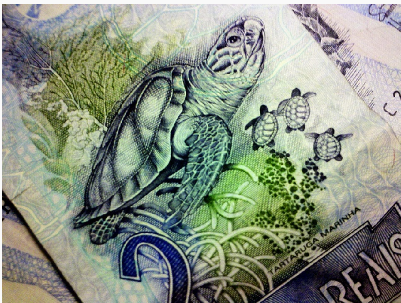
Turtle on a Brazilian Real bank note.

Luiz Lula's 2002 presidential campaign and victory illustrate this dynamic. Santiso also places his Brazil study in the appropriate historical, political, and financial contexts. For example, he notes that Lula's campaign-trail comments about debt restructuring must be considered in light of financial markets' extreme sensitivity to debt following Argentina's 2001 public debt default. After Lula's electoral victory however, an IMF agreement to maintain certain fiscal and economic policies, as well as the Lula government's decision to place the "right people" in the ministry of finance and central bank, all acted as confidence anchors. The empirical component of this case study further supports the hypothesis that political uncertainty affects financial markets. Santiso assesses how domestic short-term interest rates (using the "Special System for Settlement and Custody [SELIC]), exchange rates, and the long-term interest rates for external public debt (over)react to elections. This analysis supports the author's claim that market instability originates not in the democratic process itself but from the perception of institutional weakness and uncertainty.