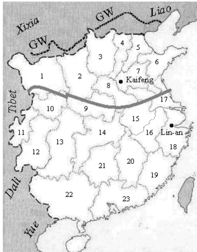
Figure 2. Geopolitical Map of Song China

Note: Along the northern border were the Khitan Kingdom (Liao) and the Tangut Kingdom (Xixia) prior to 1127. The grey line = new international border between the Jurchen Jin and the Southern Song after 1127. GW = the line where the old Great Wall had laid. Numbers represent provinces ( lu ), as in 1111 AD. Kaifeng was the capital of the Northern Song; Lin-an, that of the Southern Song.