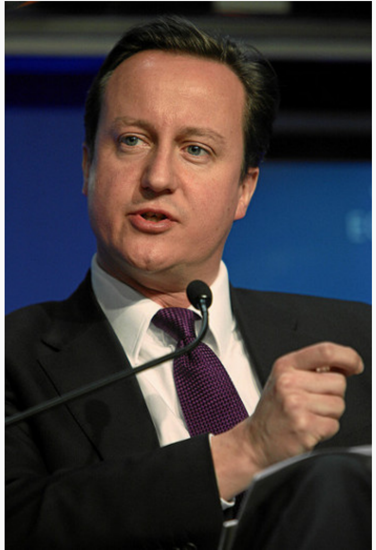
David Cameron

of EU membership are problematic seems consistent with Conservative identifiers' higher likelihood of disapproving of EU membership. These levels of disapproval are much higher than those among Labour and Lib Dem identifiers, and this difference is sustained over time. In every survey conducted between June 2005 and December 2012, a majority of Conservative identifiers have expressed disapproval. The average level of disapproval for Conservative identifiers is 66 per cent. Conversely, the average levels of approval for Labour and Lib Dem identifiers are, respectively, 64 per cent and 69 per cent.