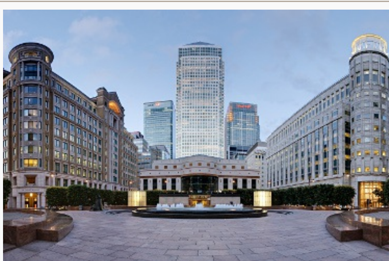
Canary Wharf, London, Credit: David Iliff (CC BY SA 3.0)

These skewed incentives drive excessive risk-taking among traders, promoting marginal and sometimes "value-destroying" mergers and acquisitions by investment bankers, and the sale of inappropriate financial products by retail bankers. All else being equal, larger, riskier trades, bigger mergers and higher volumes of products sold are more profitable. As the Libor scandal, the widespread mis-selling of financial products and support for dubious tax-evading activities all show, the starry-eyed pursuit of ever-larger bonuses also drives bankers to cut corners with the law. As a consequence, the financial system ends up being larger, more complex and has more frequent transactions than is socially optimal or financially necessary to support the real economy. Rent seeking at an individual level by bankers, where they can pocket the gains and impose losses on taxpayers and thus the rest of society, is reflected at an aggregate level by a banking system that has become prone to parasitic rent-seeking.