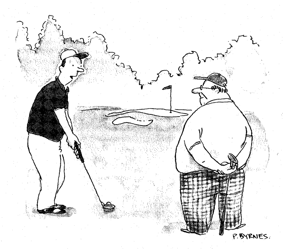
"Researchers say I'm not happier for being richer, but do you know how much researchers make?"