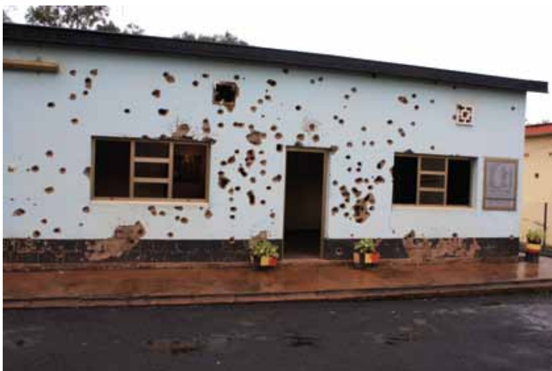
Kigali building where 10 Belgian soldiers serving in the UN Assistance Mission for Rwanda were shot by government soldiers during the genocide of 1994.

6. Forms of civic violence are ubiquitous in the cities of the developing world and they are deeply political in character. Gang warfare, crime, terrorism, religious and sectarian riots, and spontaneous riots or violent protest are increasing throughout the developing world. While these conflicts are rarely fought as direct challenges to state power, they are nevertheless usually expressions of deep grievances towards the state or politically and economically powerful urban elites. Treating them as criminal activities, or simply repressing them, may achieve some peace and order