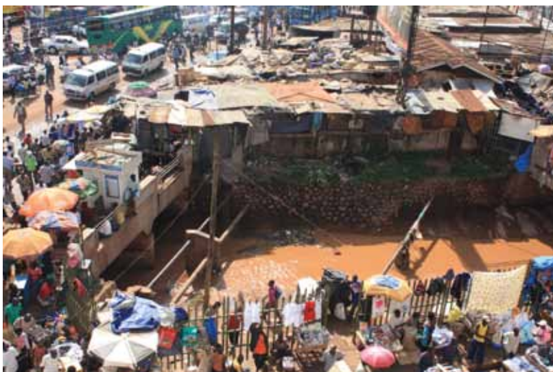
Owino Market in Kampala

6. Assessing the initial conditions of a polity and the parameters of the political settlement on which the state is based must be a prerequisite before prescriptions for far-reaching economic reforms are adopted. Rapid economic liberalisation associated with structural adjustment programmes in Africa, even when these programmes were only partially implemented, had a much more devastating impact where political settlements and elite bargains were factionalised than where more solid political organisations reigned, as in Tanzania and Zambia.