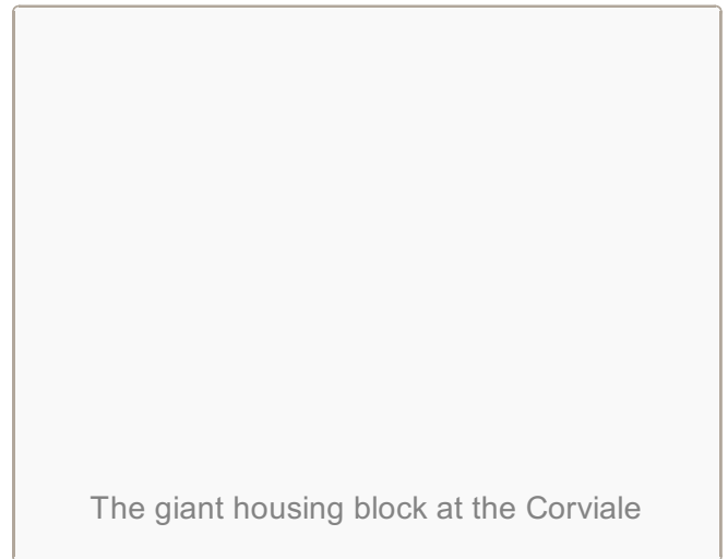
The giant housing block at the Corviale

The swarming robot beetles of the Corviale Void are designed to evoke this immersive and 'non-sensuous'