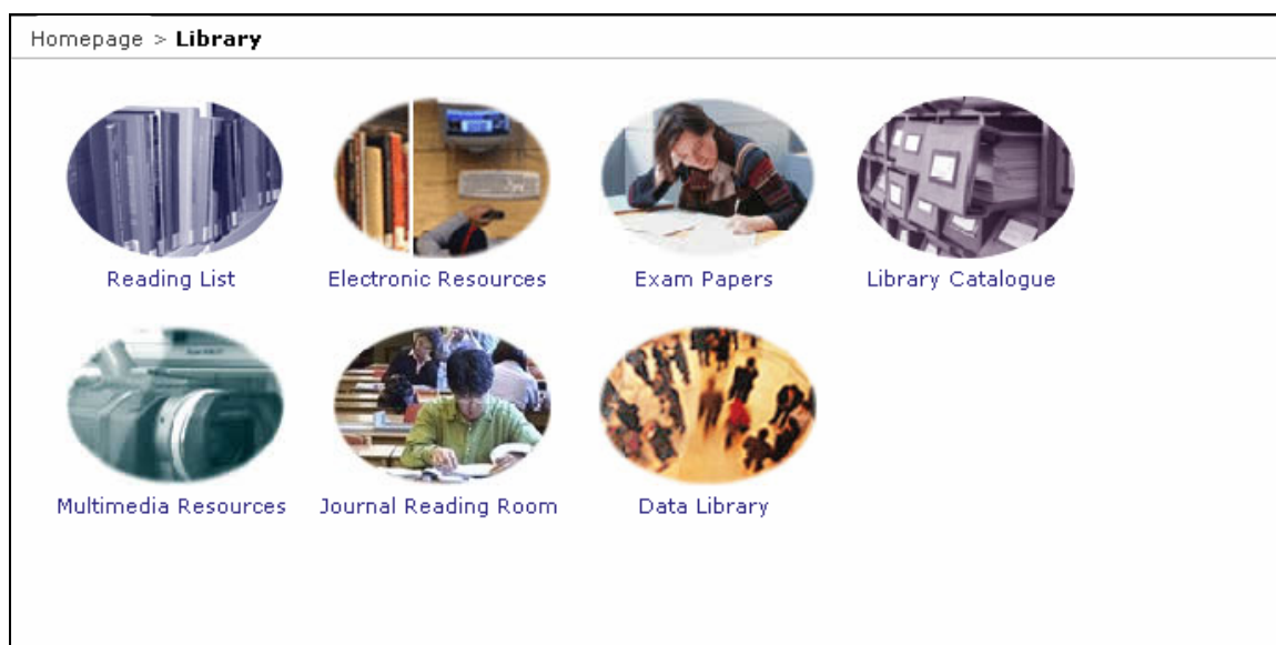
Figure 3: The Library Area in WebCT at LSE

The Library Area Template is analogous with a ‘course library’ allowing academic staff to customise the resources they present to students. All the icons are optional but the key areas it includes are: