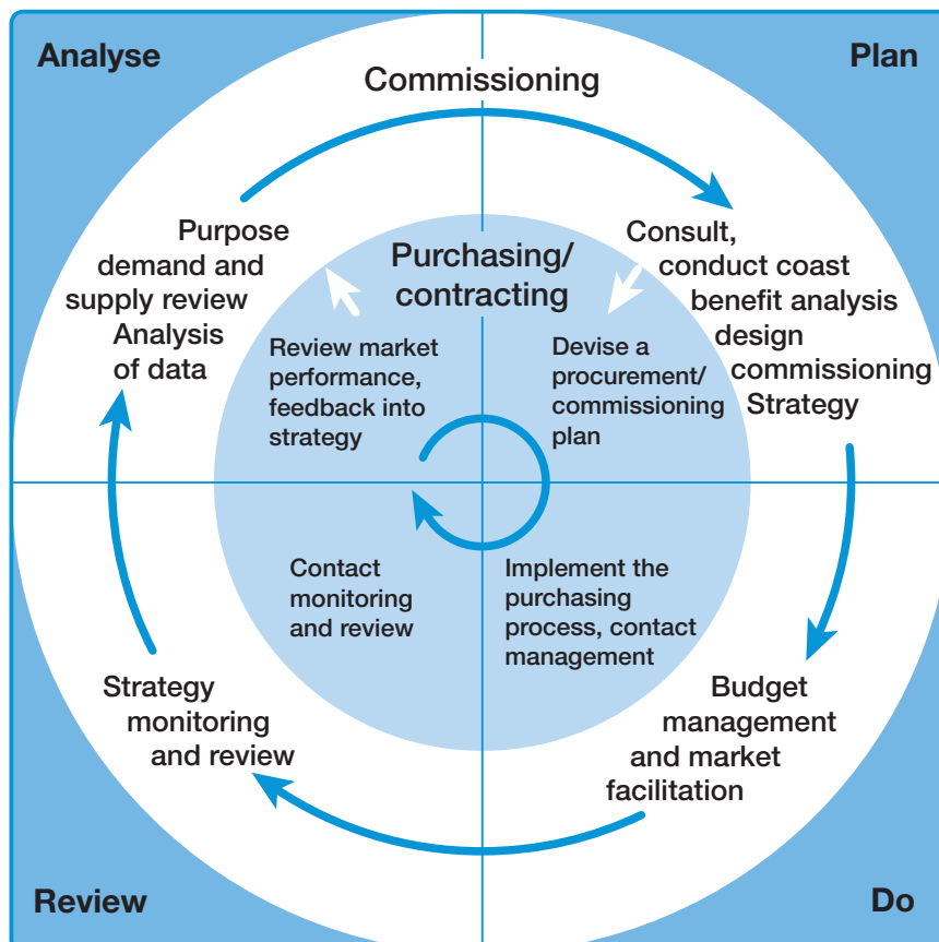
Figure 2: The Commissioning and Contracting Framework.

In process terms, social care commissioning has also traditionally been described as a continuous cycle of interlocking elements. Probably the best-known example in currency during the study reported here is that produced by the Institute of Public Care (IPC) at Oxford Brookes University for the Community Services Improvement Programme of the Department of Health (CSIP, 2007a). Like the NHS commissioning cycle, it comprises a number of distinct elements related to each other as depicted in Figure 2. Three features are particularly noteworthy. First, it seeks to represent the interrelationship