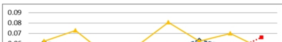
Figure 1: Socioeconomic inequalities in self-reported health in England, 1997- 2007

Overall we found that socioeconomic inequalities in self-reported health and limitations in daily activities appear to be relatively constant over time, although both indicate possible decreases in the final period. We found a small decrease in inequalities in self-assessed health from 2005 through 2007, while there is a more marked increase in inequalities in this same period (2005-2007) for suffering long-standing illness. As Figure 1 shows, over the period, socioeconomic inequalities in health measured by our index fell for self-assessed health; rose for long-term illness; and fell for daily living activities scores.