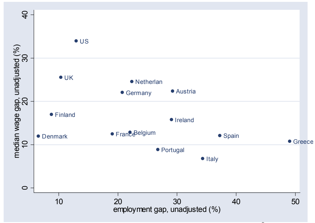
Panel A: Unadjusted gender gaps. Correlation: 0.455*