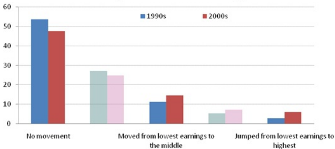
What happened to the lowest earners? (%)

Of course, upwards mobility requires downward mobility. So when we look at the richest 20 per cent of wage-earners (chart below), it’s significant that we see a small fall between the 1990s and the 2000s in the proportion who started the decade at the top