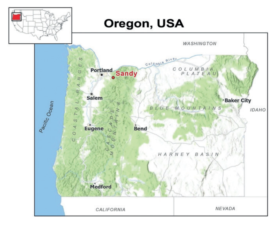
3.1 Map of Oregon, USA. Created by Sophia Ford

and young saplings, both of which enabled fires to spread at rates that precluded effective firefighting. Gavin found that in the Holiday Fire west of Eugene, one of the many fires that burned in Oregon in September 2020, the timber giant, Weyerhaeuser, is the largest landowner. In this fire, over 70 per cent of the burned areas employed clear-cut rotation forestry (Gavin, 2020). In contrast, public lands, which have been managed through clear cutting, prescribed burns and regular thinning, were characterized by second-growth forests and were better able to withstand the fires.