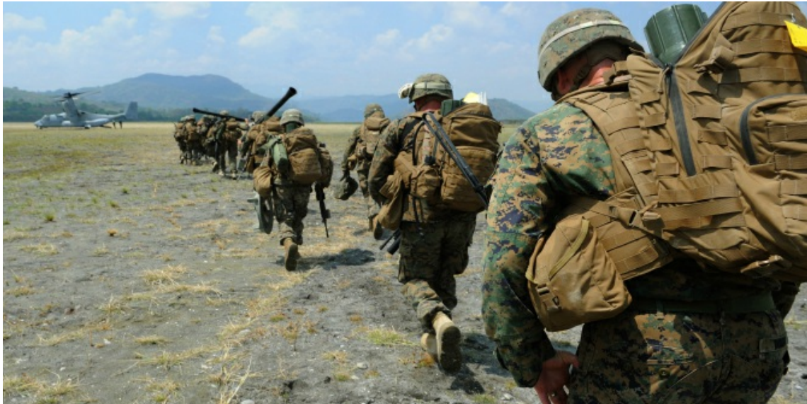
Image Credit: Philippine marines with US marines on a bilateral training exercise, 16 April 2013 ( US Department of Defense Public Domain )

Chambers and Waitookiat state that Thailand's military has the potential to experience the greatest increase in khaki capital in Southeast Asia, predicting it to become 'the envy of Southeast Asia's militaries' (82). The Thai military's active engagement in capital-grossing activities, both legal and illegal, enables it to sustain its ideological doctrine of intervention and mistrust of civilian and democratic leaders. Its unique relationship with the royal family has provided it with legitimacy in its interventions, including the most recent coup in 2014. Crucially, it has maintained total budgetary independence, making it unhindered in pursuing the army's agenda. No other military has operated quite so openly in illegal capital-generating activities, the narcotics trade in particular.