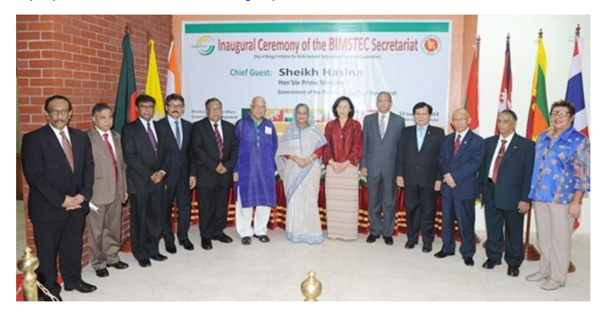
Cover Image: Inaugural Ceremony of the BIMSTEC Secretariat, Dhaka in 2014.

Formed in 1997, BIMSTEC garnered significant attention as an alternative platform for the South Asian integration. This is given that fact that there is predominance of South Asian countries in the group and absence of India-Pakistan contention. It is expected that BIMSTEC will generate lucrative results as a trade group so that non-members can understand the disadvantage of non-accession. The key driver for South Asian integration through BIMSTEC is the Free Trade Agreement (FTA), the framework of which was signed in 2004. The Framework Agreement on the creation of FTA specified well defined deadlines for various stages of economic integration. The FTA seeks to combine the economies of South and South East Asia, which are rich in natural resources and is home to 1.5 billion people. The combined GDP of the group is US$ 2.7 trillion.