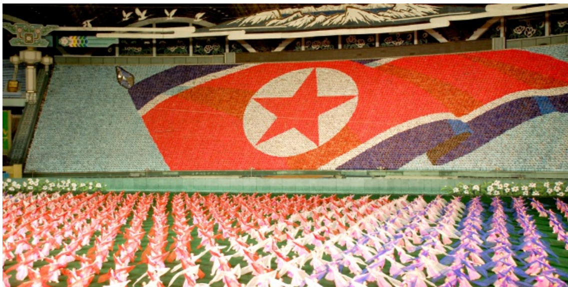
Pyongyang, Arirang (Mass Games), North Korea, 2007

Instead of focusing on ideology, Dukalskis concentrates on six key functions of the ideological systems operated by the Burmese, Chinese and North Korean governments: their ability to ‘conceal, frame, blame, cultivate a sense of inevitability, mythologise and promise brighter futures’ (59). The principal aim of these activities is to subvert public discussion to such an extent that the public opinion of citizens is largely depoliticised, whilst sprawling networks of barely-concealed spies, informants and state security agents act as ever-present deterrents: the enforcing hand of the state that can deal quickly with acts of dissidence.